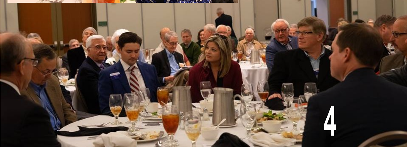
4—Full table of members